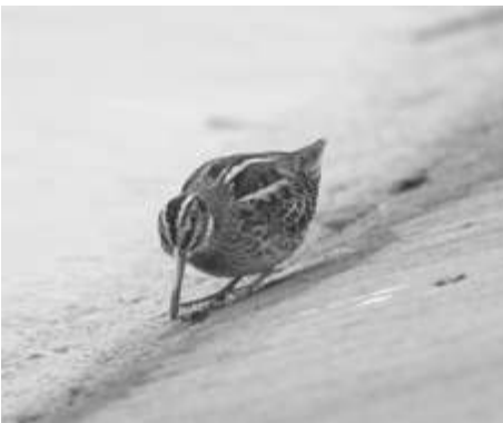
Jack Snipe, QE2 Res., 23 Dec 2010

Jack Snipe The first were at Beddington SF on Sep 26th. Wintering birds were reported from Beddington SF (up to 4), the London Wetland Centre (up to 3), QE2 Res (2 feeding in the cracks of the reservoir basin on Dec 23rd), Tice's Meadows, Badshot Lea (1) and Wimbledon Common (1).